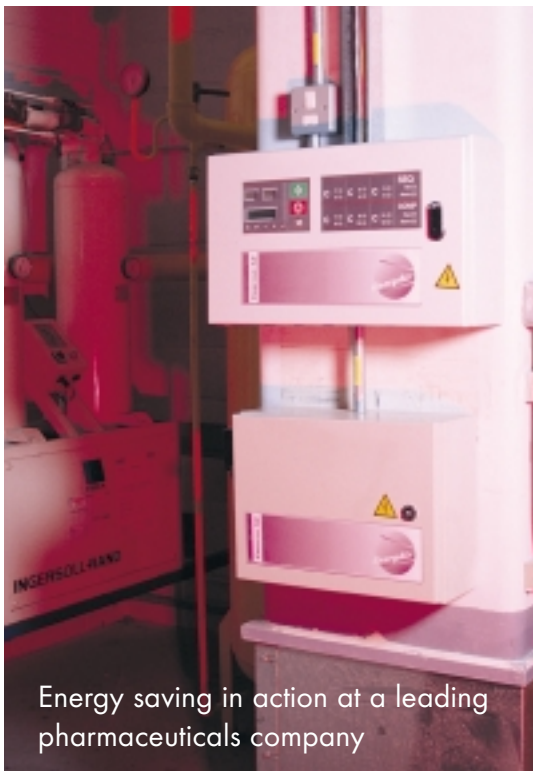
Energy saving in action at a leading pharmaceuticals company

In today's pressurised global economy the economics of energy saving make sound financial sense. International agreements on global warming mean that companies have to undertake energy saving measures as a matter of course if they are not to suffer financially from legislation such as the Climate Change Levy. However, what is not widely realised is that the savings made, often at relatively low cost to their ongoing value, are a direct profit contribution to a company's bottom line.